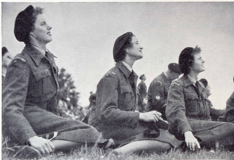
How high is it flying? What is its speed? Perhaps one of these girls will make the lucky guess and win a prize.

Not at first, but when you have served for six months at a Post or nine months at a Centre you will be required to take a Primary efficiency test. The Intermediate and Master tests which follow are voluntary. Those who pass the Master test may wear the coveted 'Spitfire' badge—the hall-mark of the aircraft recognition expert.