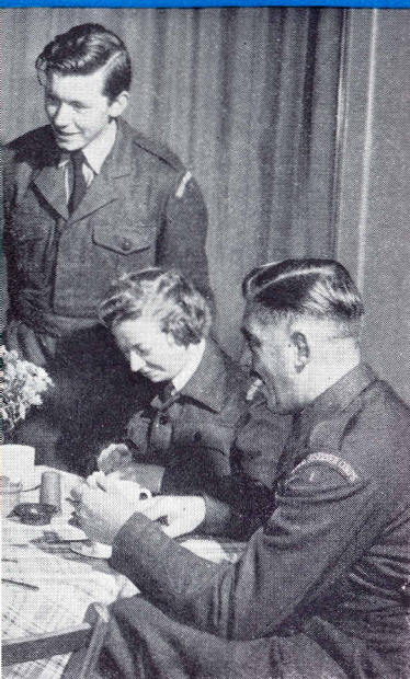
LEFT: Coffee time—a break in a busy evening!

RIGHT: The duty controller in an Operations room sits with his 'tellers' on a balcony surrounding the plotting table. Information seen on the table is passed by them direct to Fighter Command and the various R.O.C. Groups concerned.