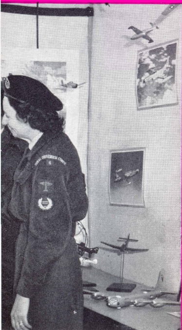
LEFT: Drawing and modelling aircraft is a fascinating step towards their recognition in the sky.

RIGHT: The duty controller in an Operations room sits with his 'tellers' on a balcony surrounding the plotting table. Information seen on the table is passed by them direct to Fighter Command and the various R.O.C. Groups concerned.